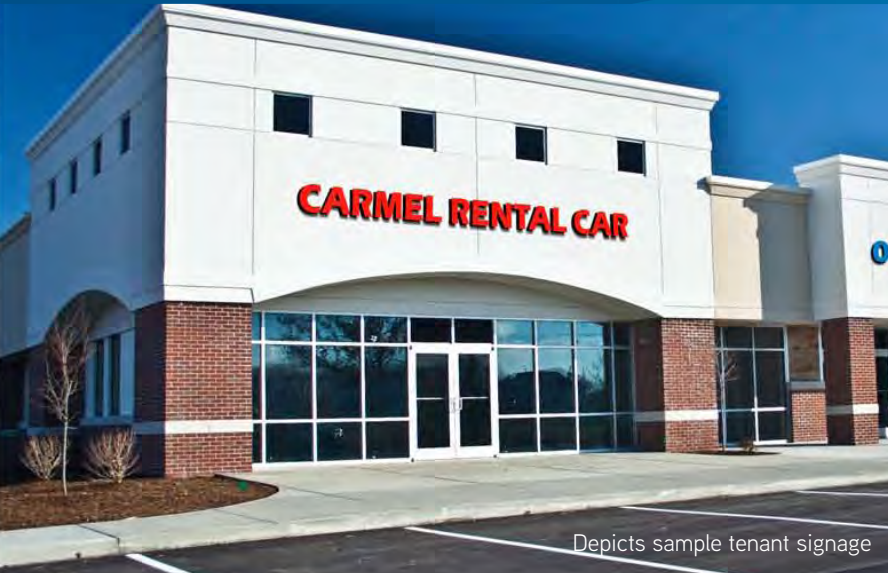
Depicts sample tenant signage

1441 S. GUILFORD ROAD, CARMEL, INDIANA 46032